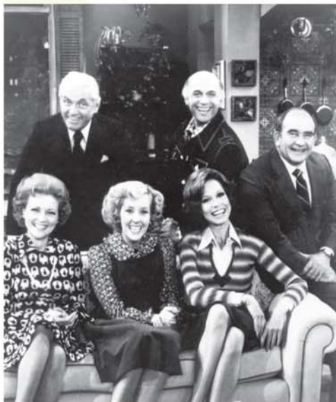
Betty and Georgia on The Mary Tyler Moore Show