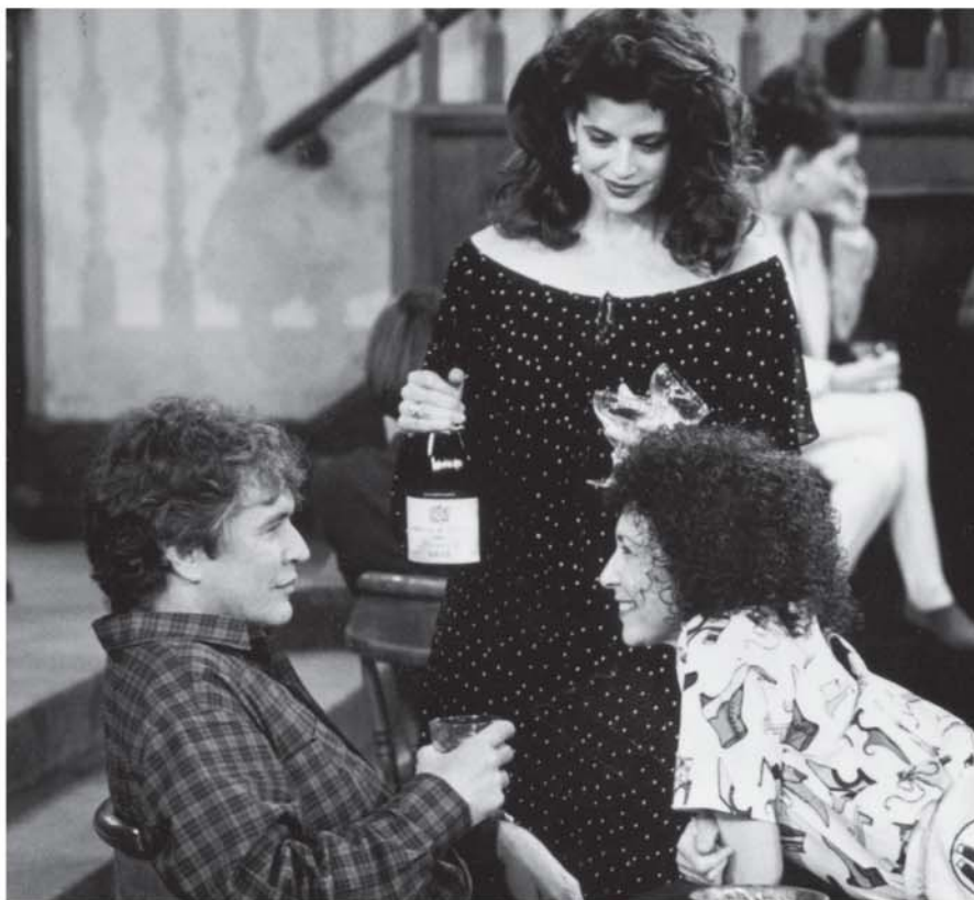
Kirstie and Rhea with Tom Berenger on the set of Cheers

Cheers waitresses Kirstie Alley and Rhea Perlman were here in December shooting the TV Land pilot Giant Baby on Stage 23. Rhea knows her way around the lot as she too guest starred on Hot in Cleveland last season... and back in 1985 her Cheers character Carla Tortelli gave birth at St. Eligius, aka St. Elsewhere , which was shot on several stages at Studio Center!