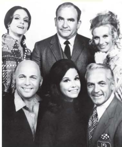
Cloris on The Mary Tyler Moore Show