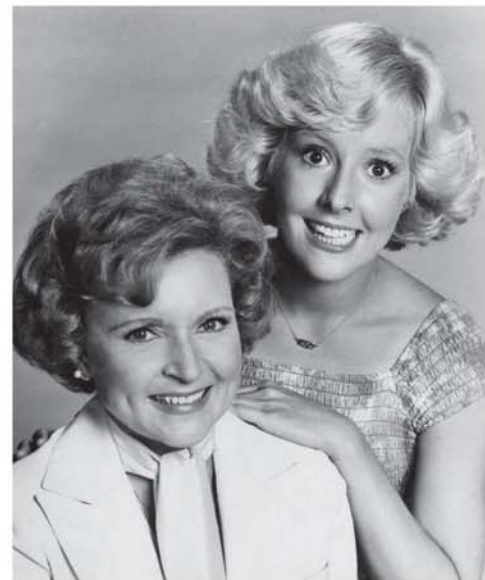
Betty and Georgia on The Betty White Show